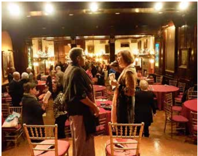
National Theatre Conference 2016